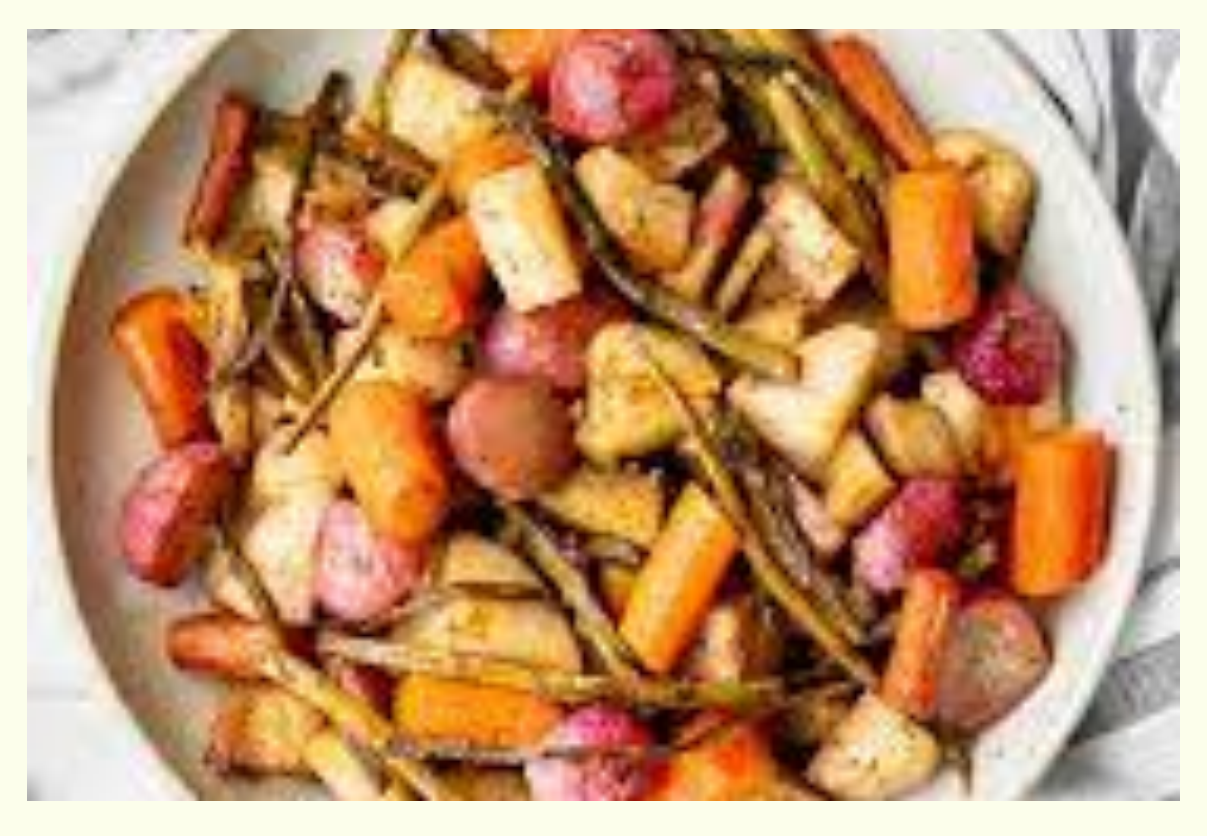
When you are looking to stay on track thru the week, roasted vegetables are perfect way to set yourself up for success. They pair well with almost any protein to provide a healthy and easy breakfast, lunch, or dinner option!

COMBINE both once fully cooked and you have a great meal base for days to come!