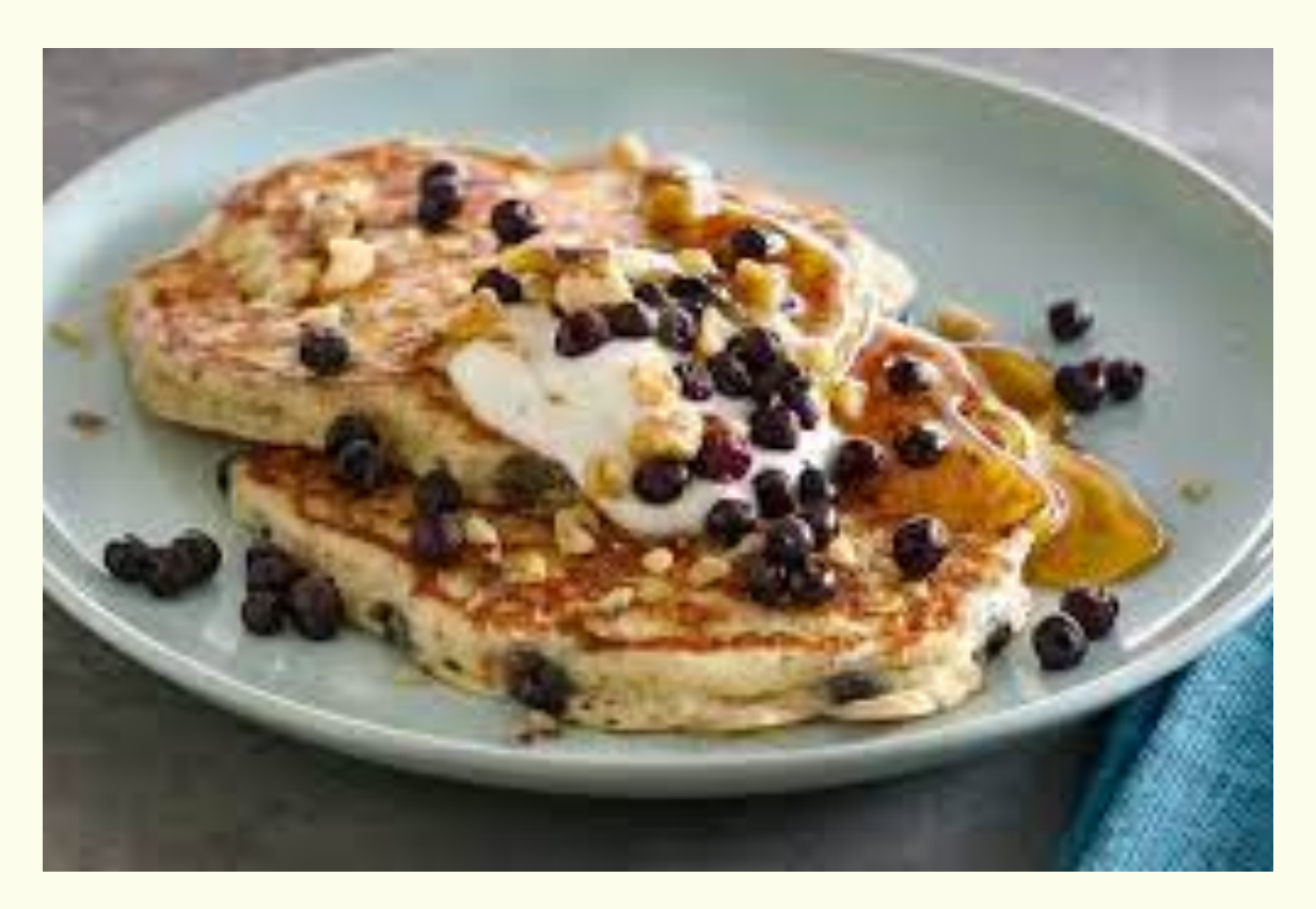
The famous True Foods gluten free pancakes. These are a must try! Option for either blueberry or bananas depending on your preference!

DROP 8-10 blueberries or banana slices onto each pancake