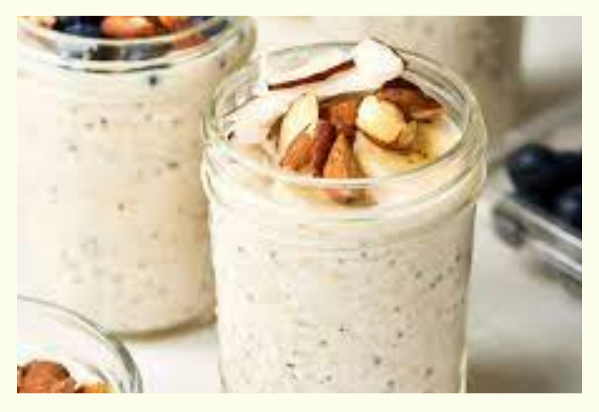
We have been using this overnight oats recipe since college. It is super tasty, and is loaded with amazing ingredients. Give it a go if you enjoy oatmeal or granola to start your day!

ADD milk in morning if consistency is not ideal