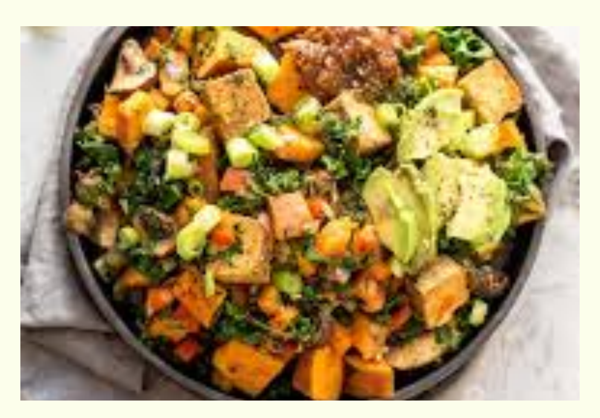
If you are looking for a quick and easy breakfast option, but don't prefer eggs, or have a sensitivity to them, fear not, you have options! Check out this simple breakfast bowl that is a perfectly balanced meal to get your day started off on the right foot!

ONCE kale has fully cooked build your bowl with sweet potato's as base, topping with ground turkey and kale.