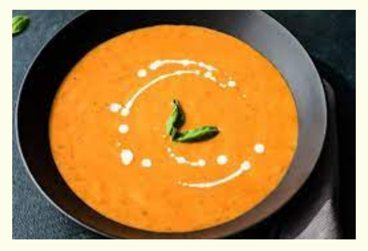
We love this tomato soup recipe for colder days or weekend hangs. This recipe is simple, has minimal ingredients, and is fairly easy to put together. Give it a go and let us know what you think!

TOP with basil if you choose and you are all set!