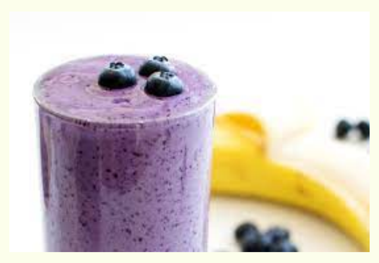
This smoothie is a staple in Kelsey's daily routine. It's a simple, nutritious smoothie that great for lunch, dinner, or post workout!

BLEND all ingredients together and enjoy! Top with 1/4 cup of gluten free granola if you want an extra kick!