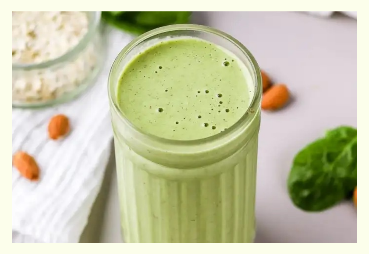
This high fat, low carb smoothie is a perfect start to the morning that provides sustainable energy without the crashes

BLEND all ingredients together and enjoy! Top with 1/4 cup of gluten free granola if you want an extra kick!