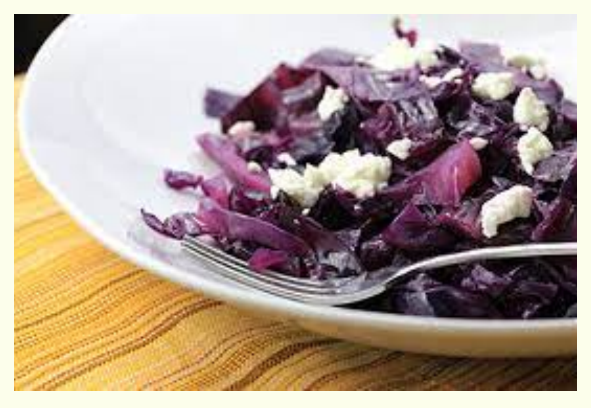
This braised cabbage recipe is one of our favorite dishes, and is a healthy take on Hillstone's braised red cabbage recipe. This is super easy to make, and so delish and healthy. Give it a go!