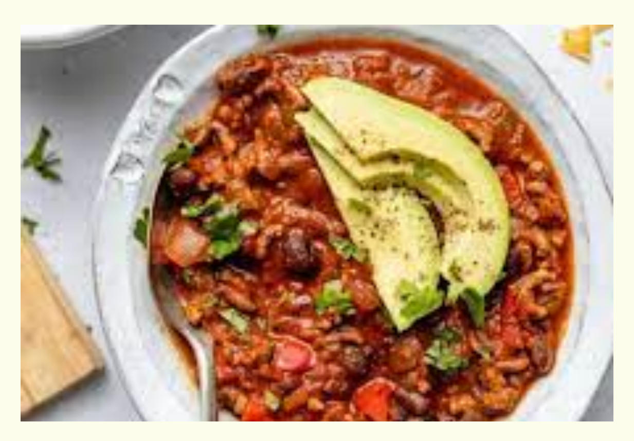
Perfect for game day if you have people coming over to the house, or just a great option for a nutrient dense meal packed with protein. Bison is a great source of protein, and relatively low in saturated fat.

ADD garlic and continue to cook for another 2 minutes.