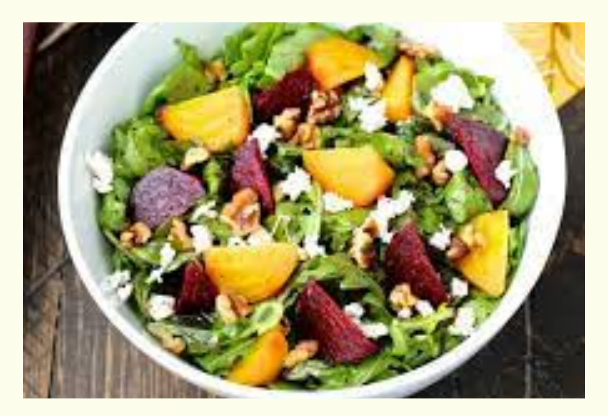
When you are looking to stay on track thru the week, having a go to nutritious base for meals is crucial. This roasted beet and arugula salad pairs well with any kind of protein for a complete meal at breakfast lunch or dinner!

ADD your favorite protein and you are ready to roll