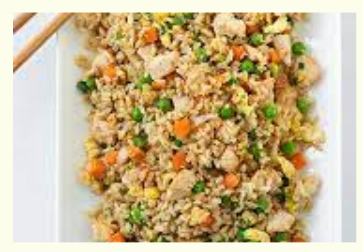
We fell upon this recipe back in the day because we didn't have much in the fridge and thought we might be able to throw together a tasty chicken fried rice with minimal ingredients. We were right! One of the most important ingredients to this recipe is a soy sauce alternative called Braggs' Liquid Aminos (most grocery stores carry the brand). This option is an extremely healthy way to not load up on sodium but still get that classic salty fried rice taste.

THROW in a bowl and you are ready to eat.