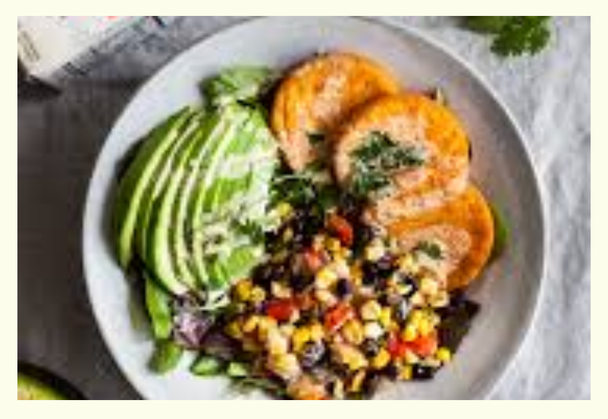
For anyone that doesn't love a typical breakfast, or doesn't/can't consume eggs, this breakfast bowl is an example of how you build your first meal of the day to set you up for success!

PLACE veggie and sausage mix onto plate, add beans on the side, and enjoy!