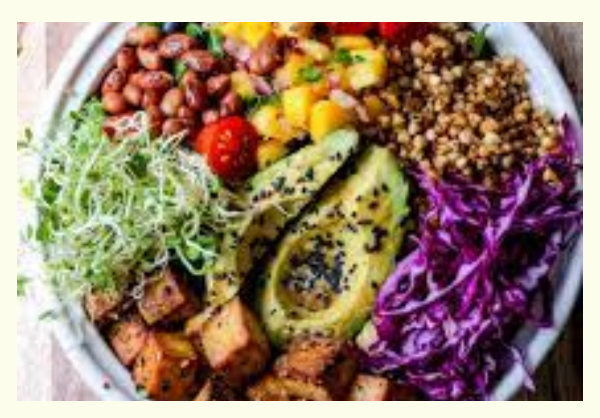
When we want something super healthy, with tons of fresh veggies, this is our go to lunch or dinner. It provides such a great switch up from our typical dinner's. If you are a vegetarian, or just like switching it up and not always having meat, this is a great option to try out!

Layer greens on bottom of the bowl, and then place grape tomatoes, cucumbers, bell peppers, olives, avocado, chickpeas, and quinoa around the center of plate.