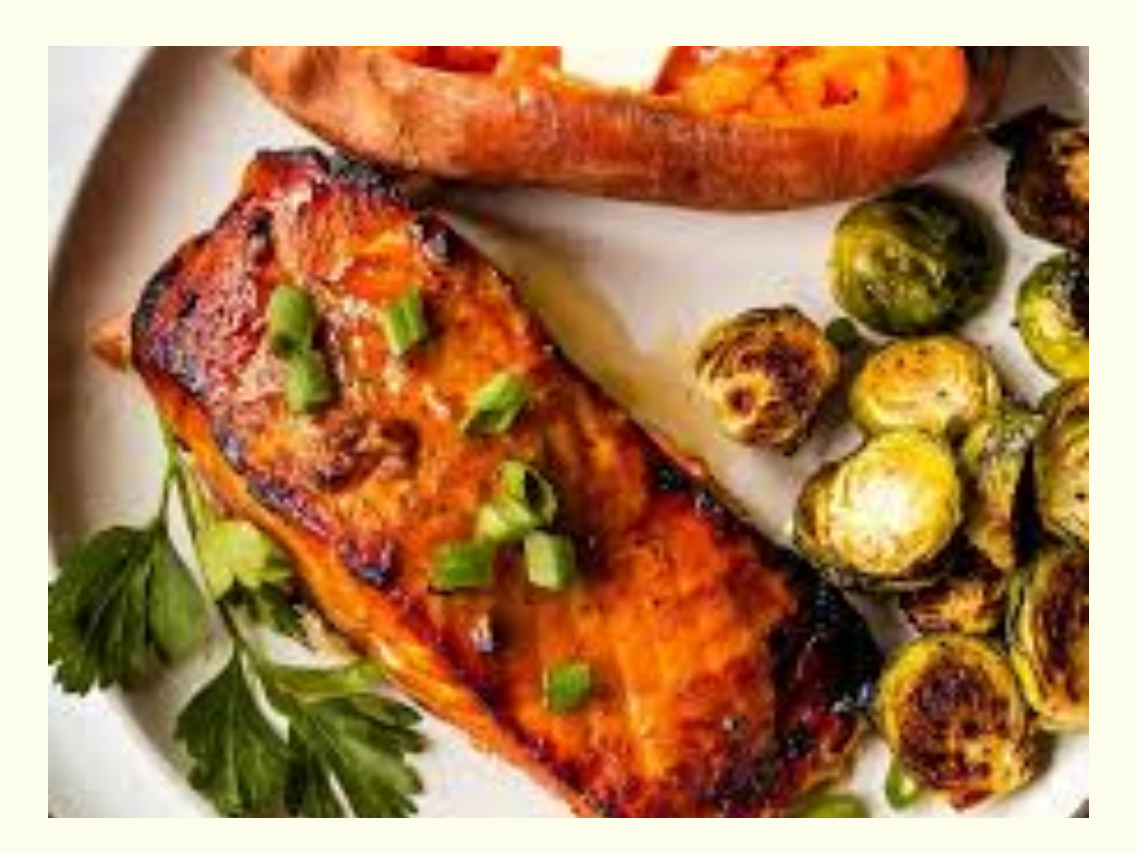
This is our go to meal on Monday's to get the week started off right! We love salmon for the sustenance but also for easy prep. If you are not a fan of salmon or fish, replace with a chicken breast. This meal is all about balance, being protein forward, moderate/low carbohydrates, cruciferous veggies, and healthy fats.

FINISH salmon with fresh lemon juice on top and you are all set!