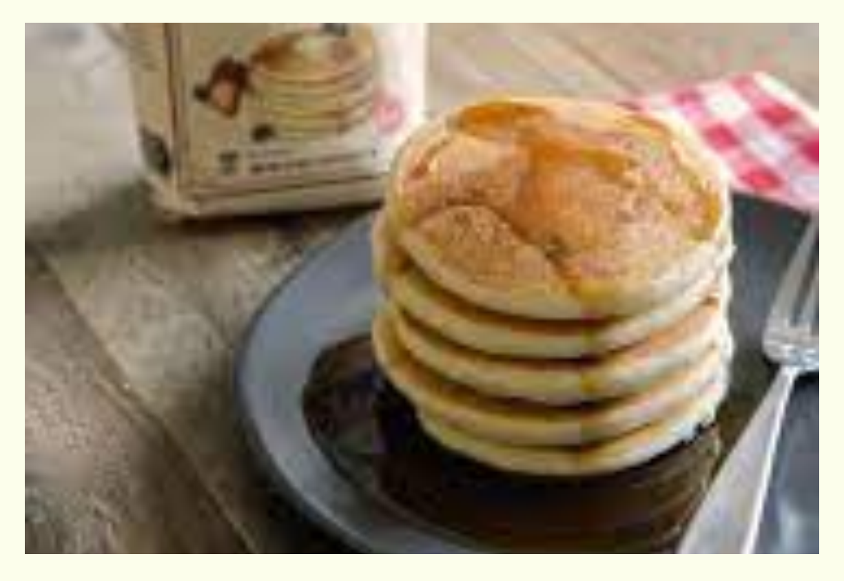
These nutrition protein packed pancakes are great for any meal. If you aren't feeling like making an ellaborate dinner, these are great breakfast for dinner option! Side note, we love all of the "Bob's Redmill" brand for baking.

TOP with butter, light syrup, or coconut brown sugar.