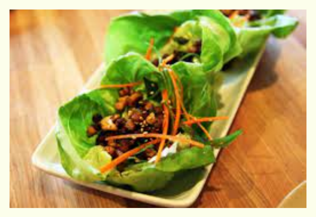
Lettuce cups with chicken and vegetables are a standard at most restaurants. This vegetarian option can be enjoyed by anyone that doesn't eat meat.

POUR the vinegar mixture into a small bowl, and the carrots and scallions, and divide amount the lettuce cups as a topper.