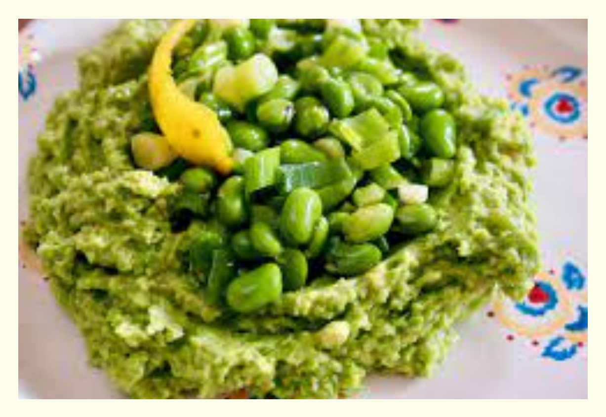
This dish is a nice twist to a typical avocado only guacamole. Side note, the fava beans do need to be shelled after cooking them.

DISH the mash into bowl, add the fried beans with olive oil to center of mash.