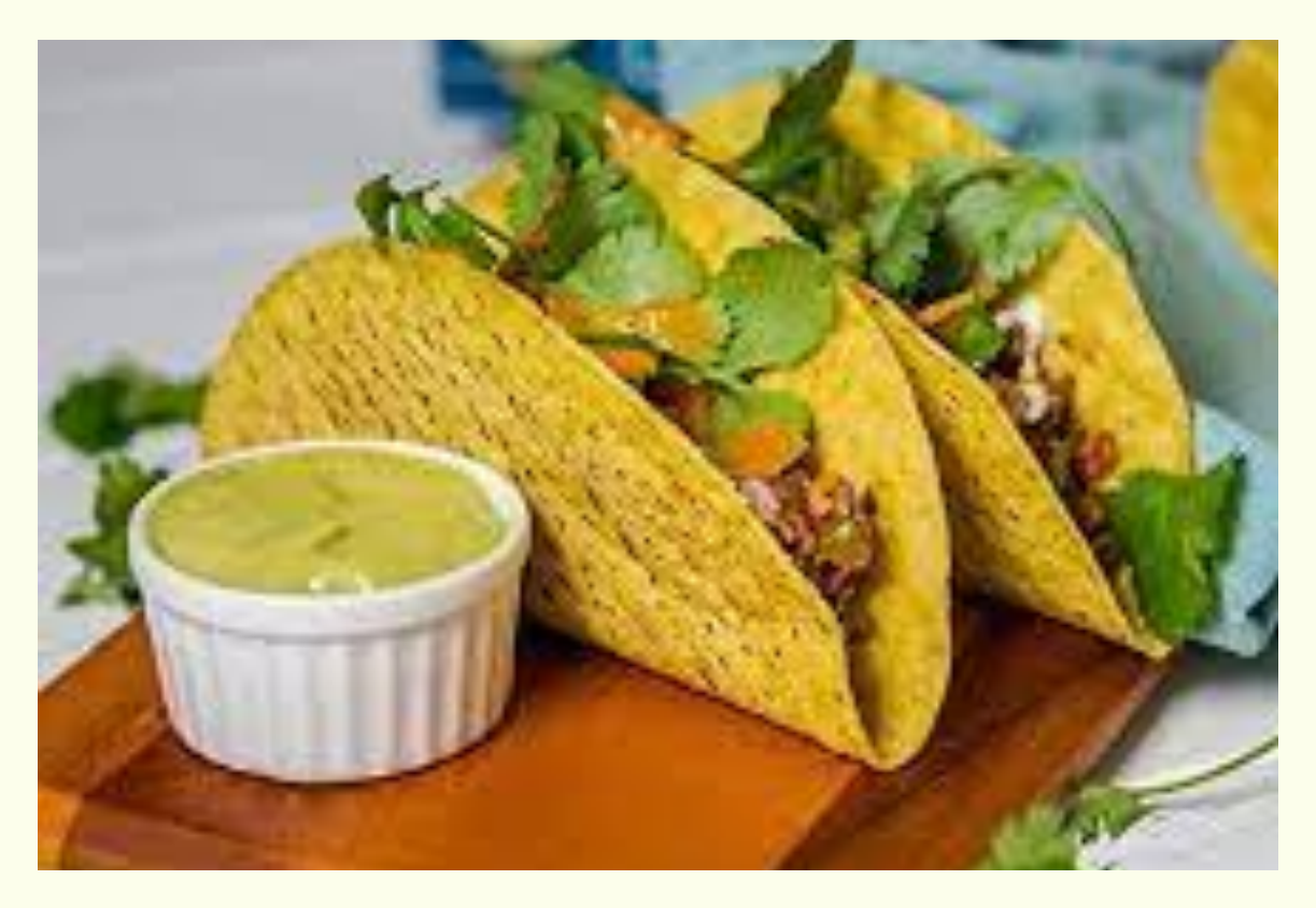
These traditional tacos are quick to make, loaded with protein, and satisfying if you are looking for a solid Taco Tuesday option!

PUT desired amount of taco shells in oven until they are heated up (should only take a couple minutes).