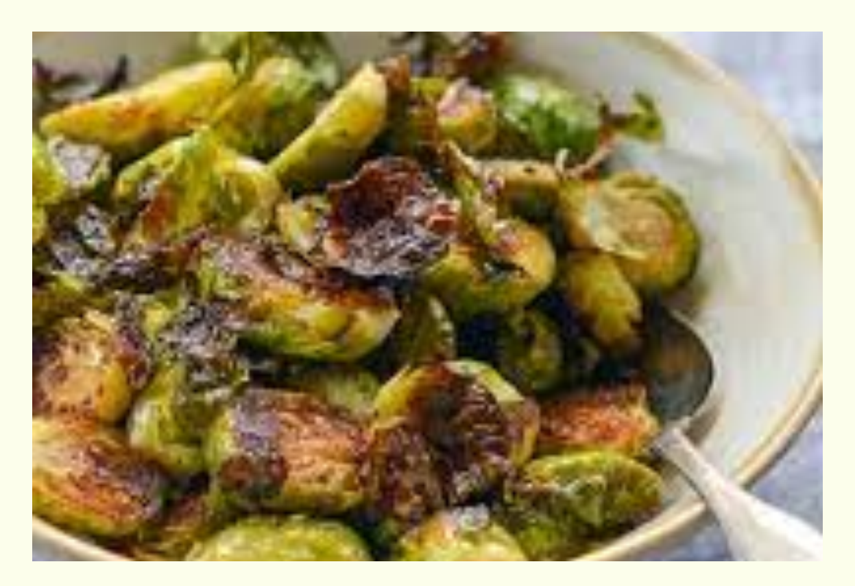
These balsamic glaze brussel sprouts are great at a base for a meal, or as a side. We like to bake the brussel sprouts so that they crisp up, but the recipe can be done in an Instant Pot as well. Bacon can always be added to this recipe as well!

DRIZZLE balsamic over brussel sprouts and enjoy!