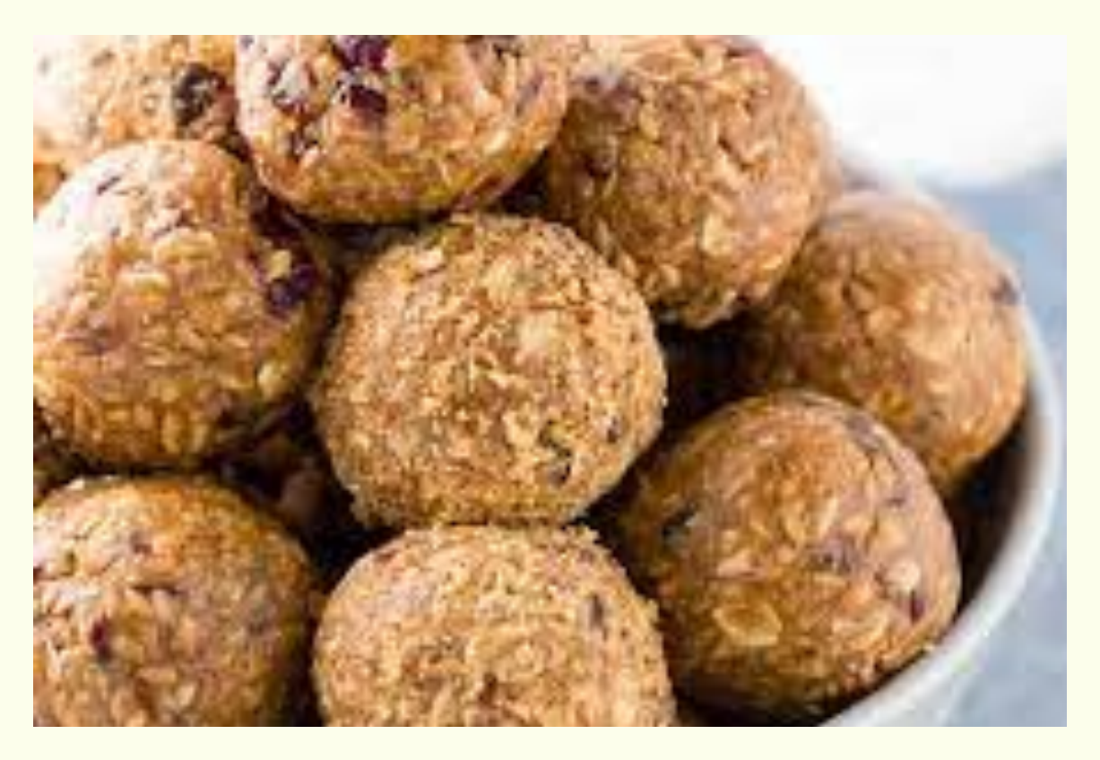
This is an awesome grab and go snack and also curbs a sweet tooth. These can be modified to any/all ingredients that intrigue you, and can be breakfast, lunch, or a snack!

TOSS in the fridge to chill for 10-15 minutes