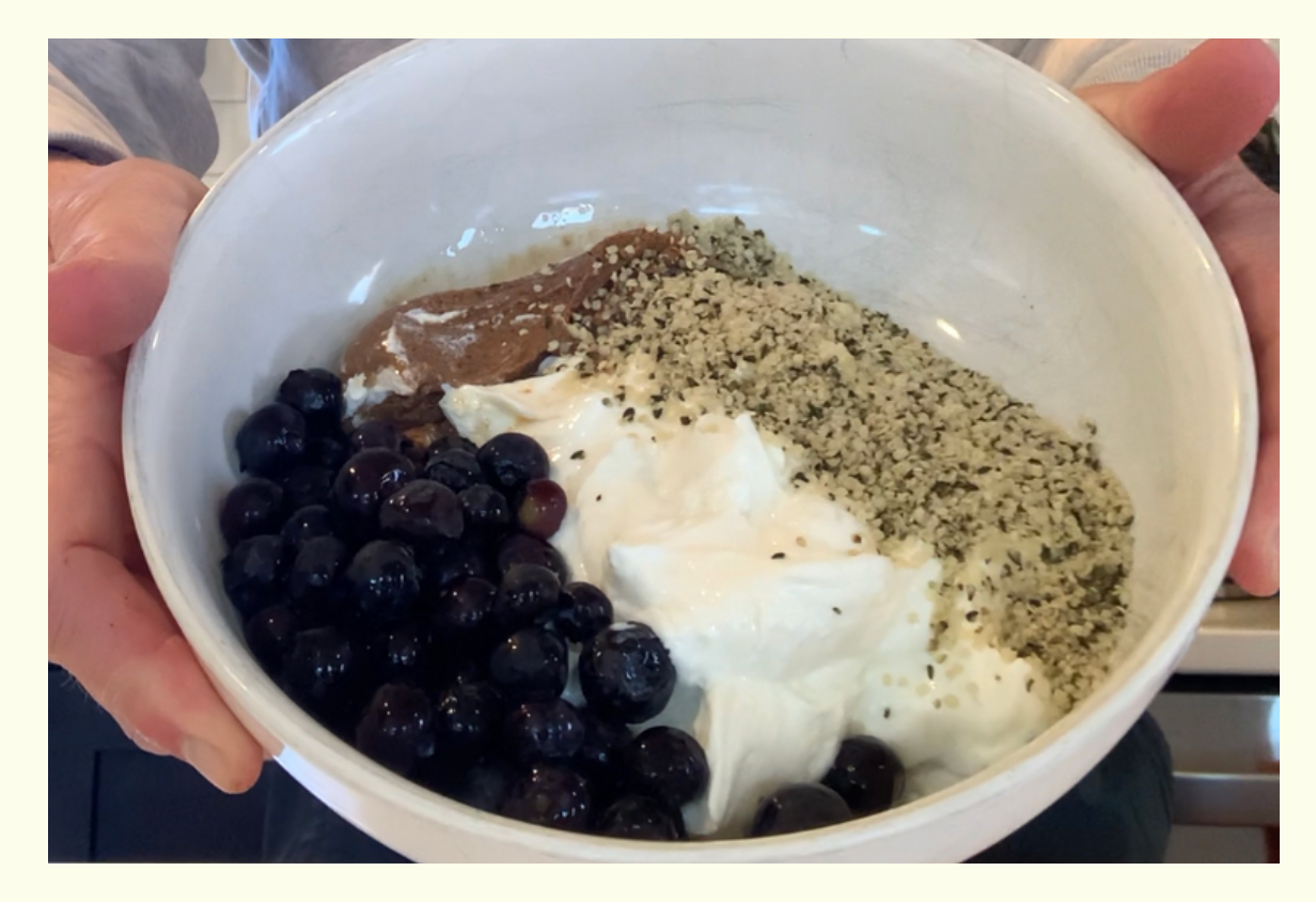
Simple, protein and fat forward, lower carbs. Prepared in less than 60 seconds. A simple, satisfying, and effective way to start out the day on the right foot.