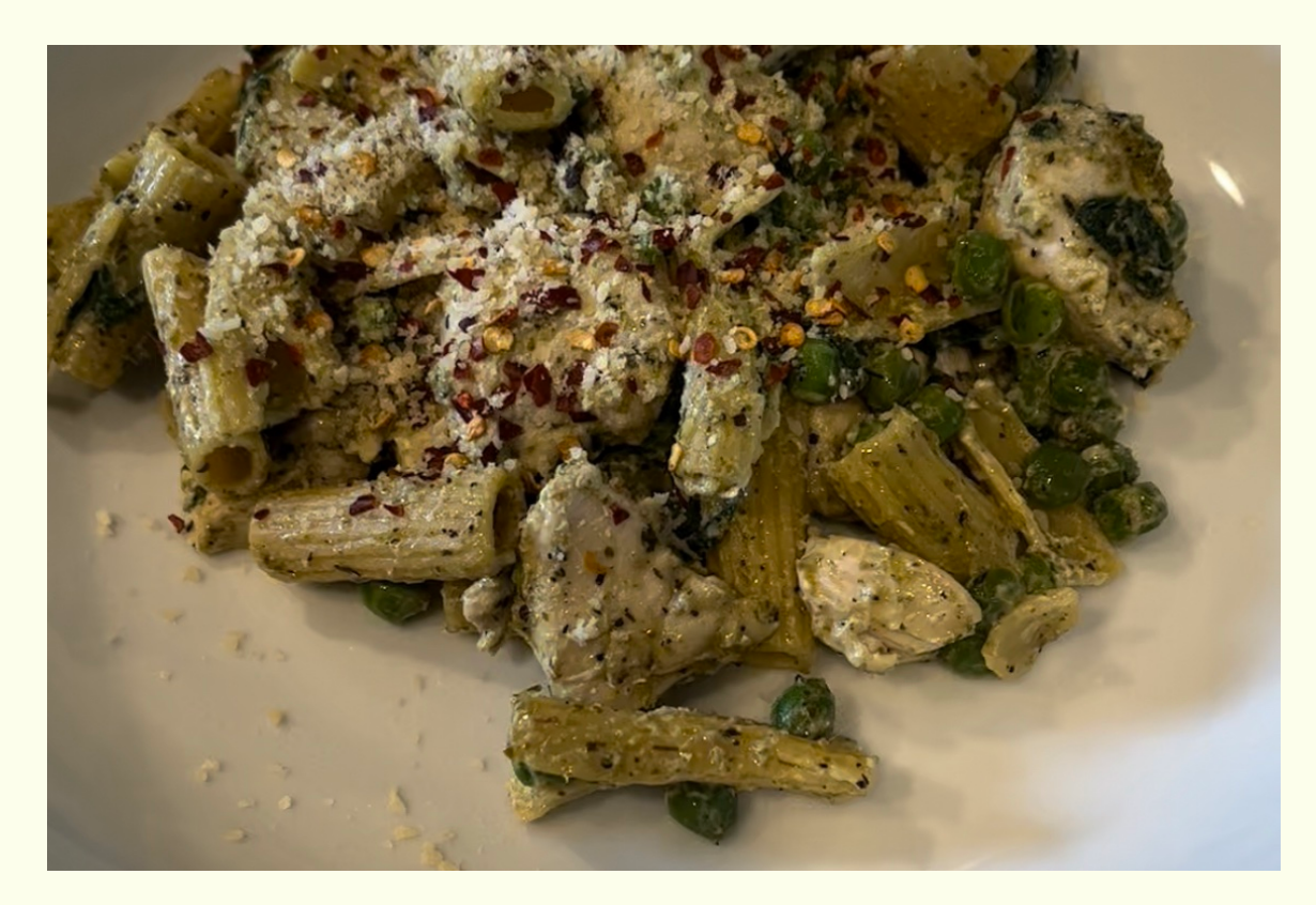
This may be the most appetizing healthy pasta dish out there today. The simplicity of the recipe, and quick prep time have made this a staple in our weekly routine.

PREPARE creamy pesto sauce by adding pesto and cream cheese, and mix thoroughly.