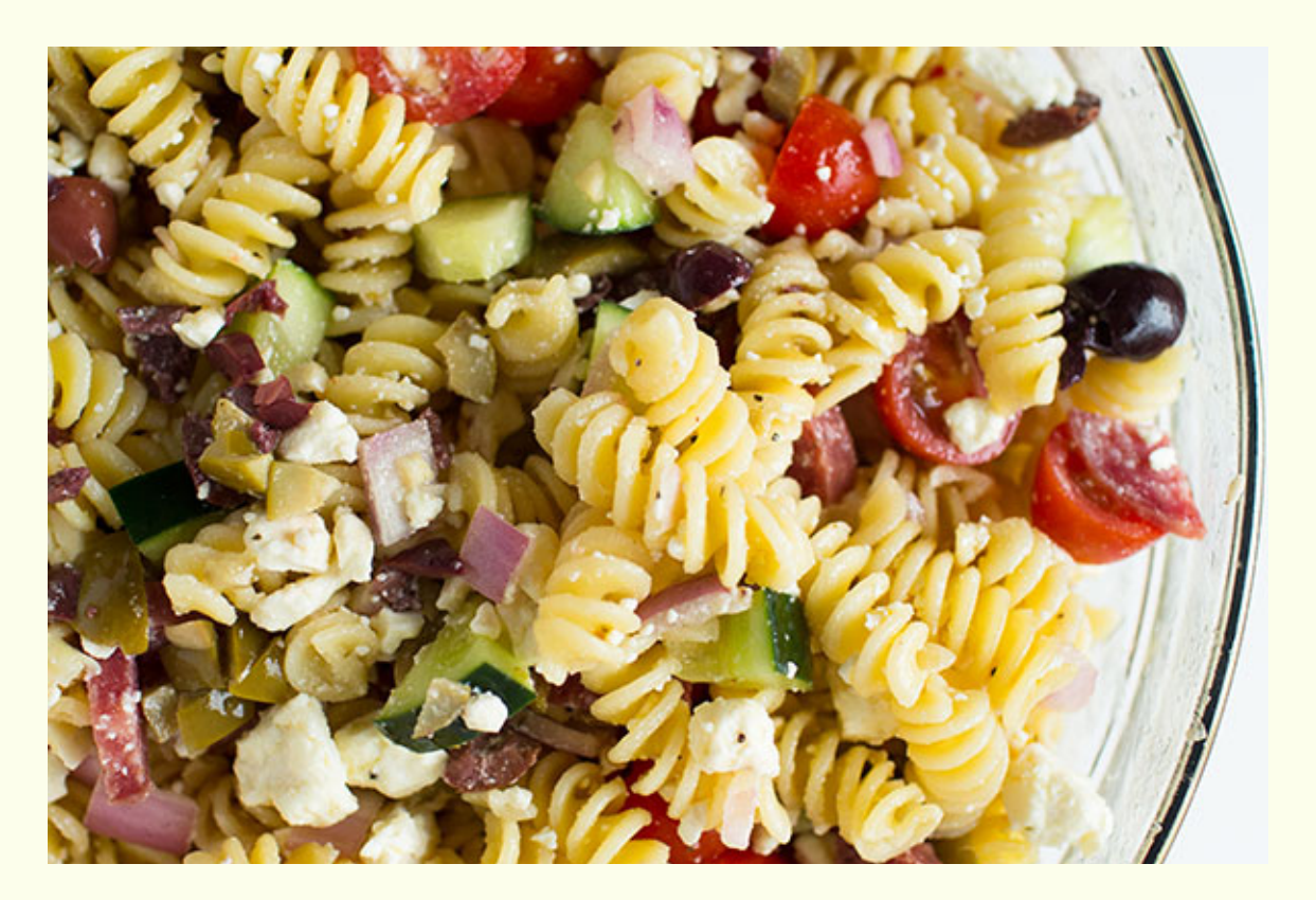
This GF Mediterranean pasta is a great option to prep for the day or week ahead and easily be tweaked to accommodate protein choices of your liking!