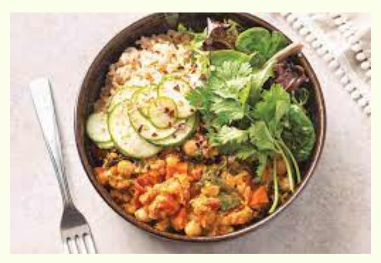
This chicken curry bowl offers a ton of different flavors as well as a ton of options to sub out or add your favorite veggies and proteins.

ONCE rice is fully cooked, add curry powder 1/2-1 tbsp depending on how spicy you like your dish