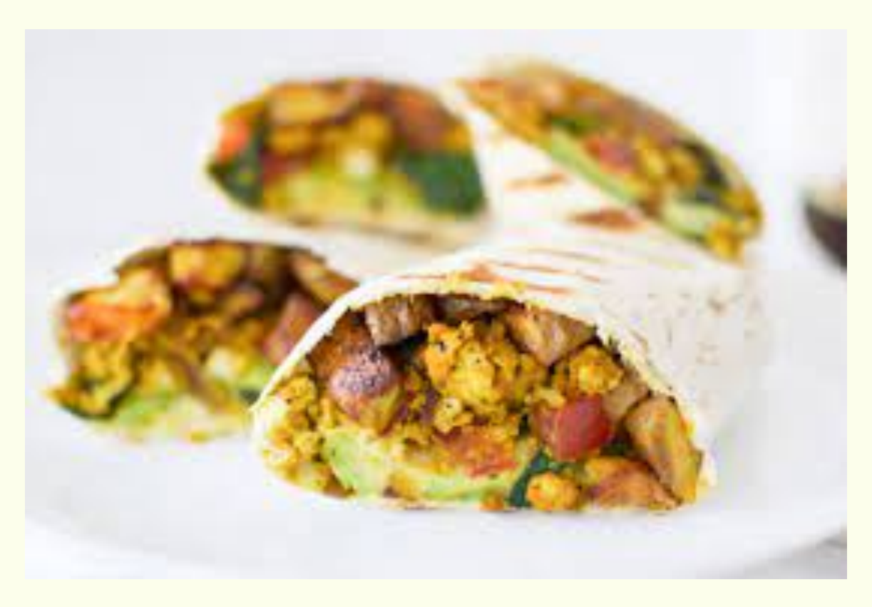
Scrambling tofu instead of eggs is good way to get the healthy benefit of soy. With the added benefits of the powerful anti-inflammatory benefits of the spices included in this dish, it makes a perfect hearty dish!

CUT in half and serve with your favorite hot sauce