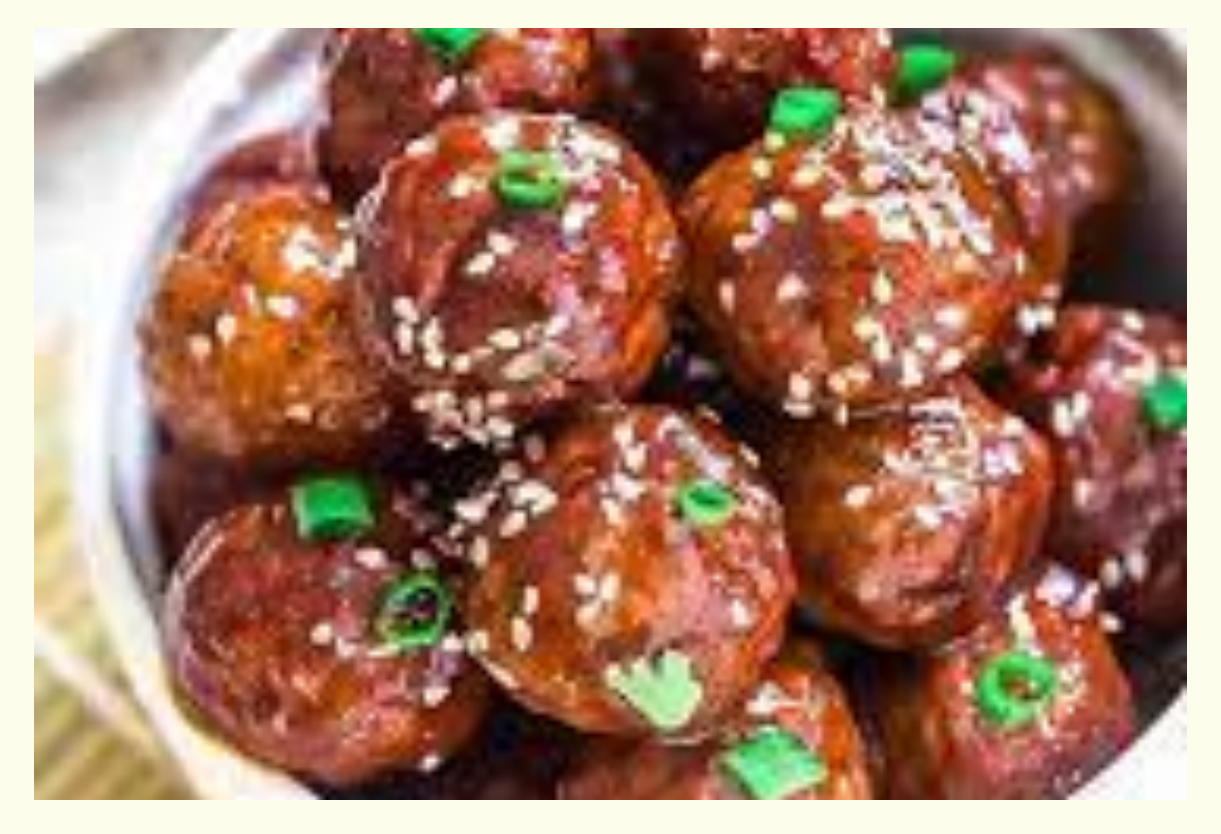
These meatballs are great to prep for the week as they make great leftovers or to pair with a healthy side dish that makes for a tasty and effortless meal. We typically use ground turkey for this recipe, but ground chicken works just as well.

ADD a side of roasted Brussel sprouts, and a bit of red pepper flakes, and you are all set!