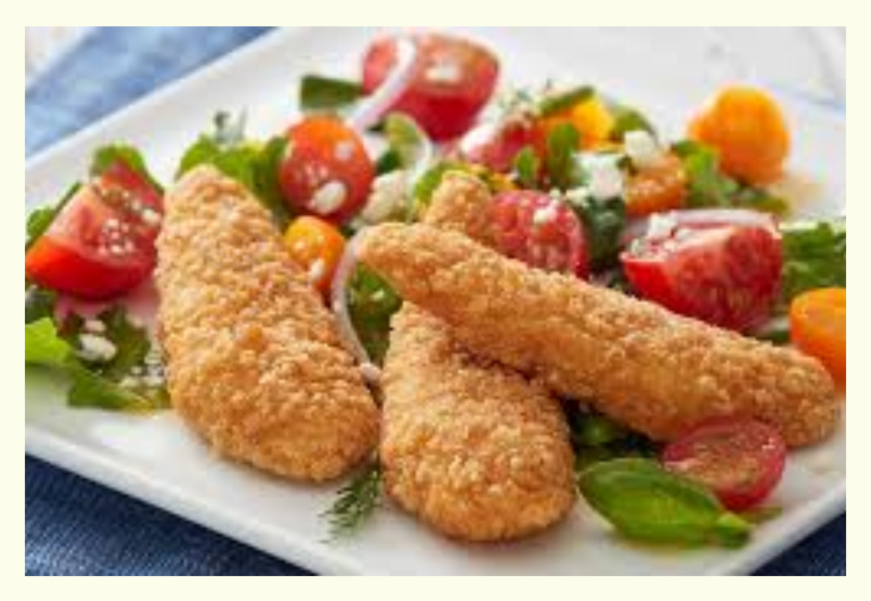
If you are looking for comfort food, or something to mix it up during the week, try making these healthy gluten free chicken tenders with a hearty summer salad!

MIX butter milk, hot sauce, and pinch of Himalayan salt into bowl.