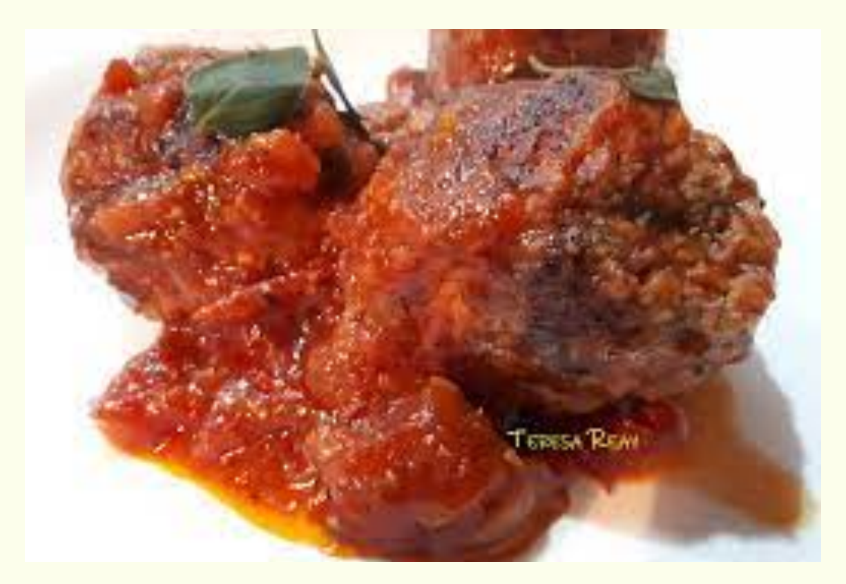
Using ricotta makes the meatballs super light and fluffy. This dish can be made a day in advance, kept in the fridge, and reheated.