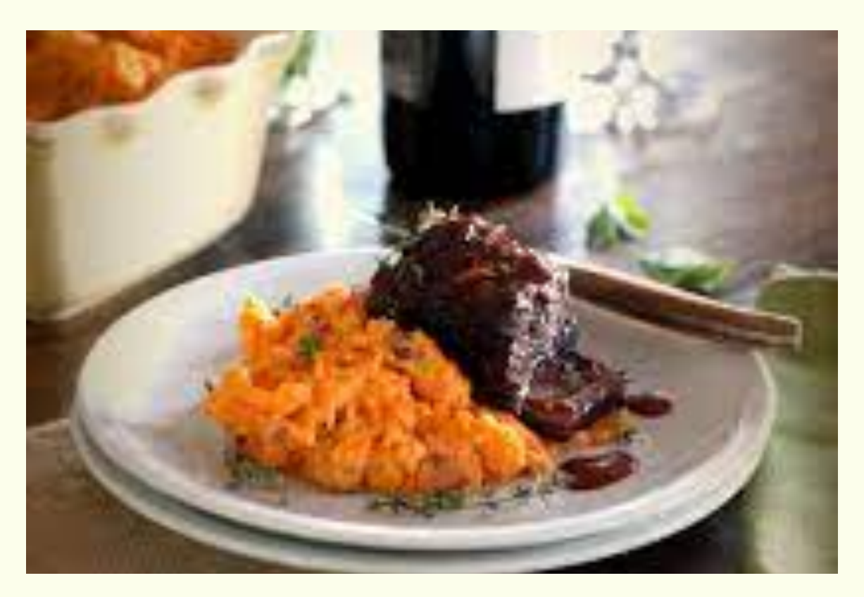
If you have the time (and the budget) I highly suggest trying out this beef short ribs and sweet potato recipe. The two pair so well together, and if you have an insta pot, the meal is pretty darn easy to put together. Try it out and let us know what you think!

WHILE meat is cooking, microwave sweet potato's until fully cooked (8-10 minutes).